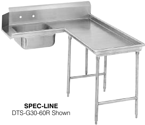
SPEC-LINE DTS-G30-60R Shown

10-1/2" EXTRA LARGE Bold Looking Backsplash with 2" return and tile edge