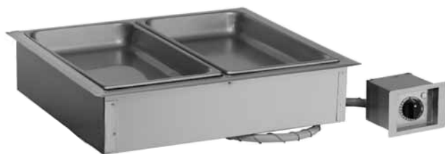
Pans not included

• The gentle heating capability of HALO HEAT significantly extends hot food holding life without continuing the cooking process.