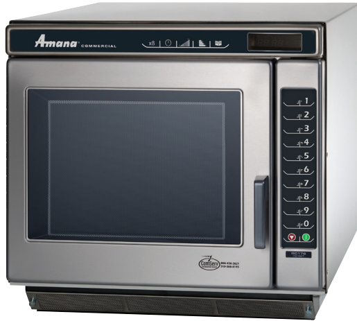
Model RC17S2 shown