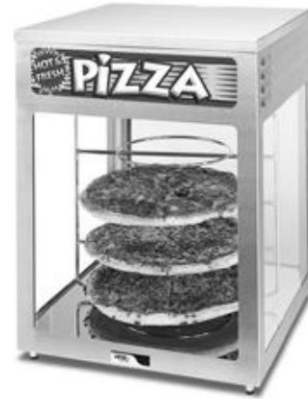
Model: HDC-4 Heated Display Cabinet