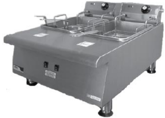
Model HEF-30T Heavy Duty Electric Fryer