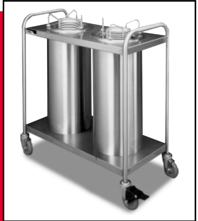
Lowerator® Trendline Adjustube® II Plate Dispensers