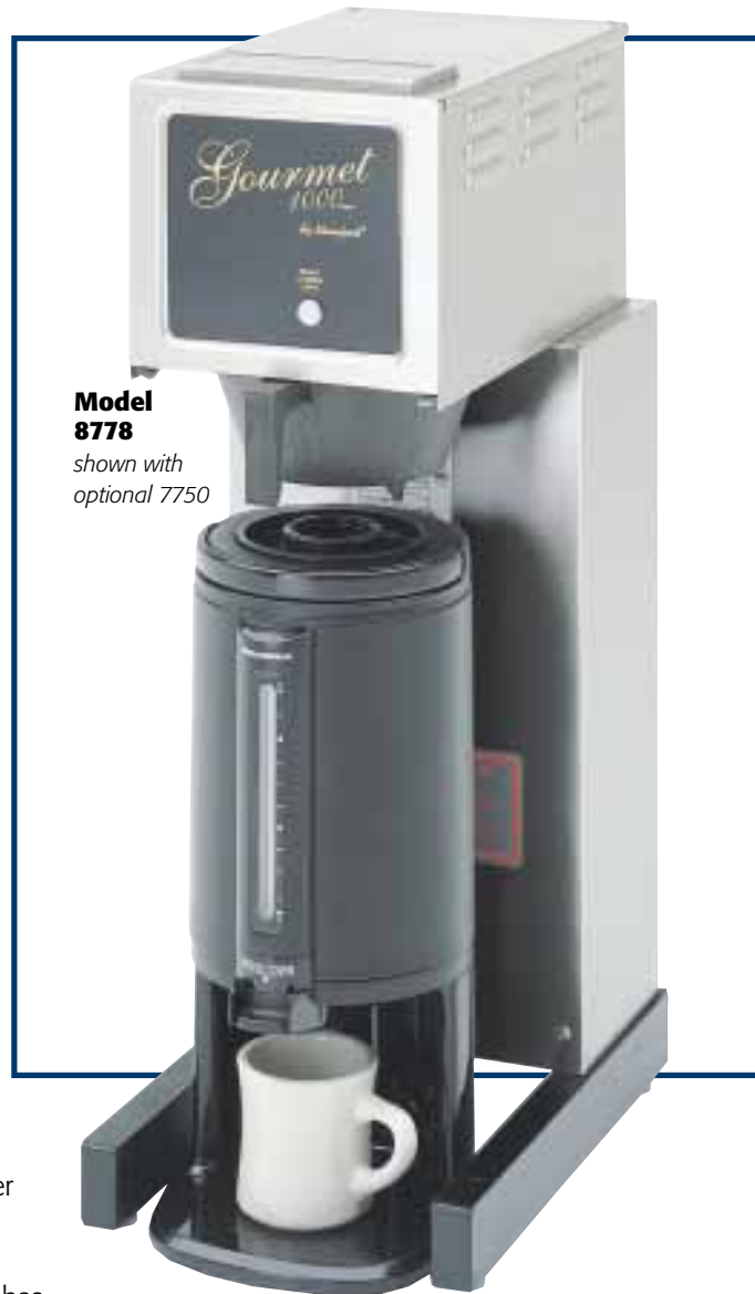
Model 8778 shown with optional 7750