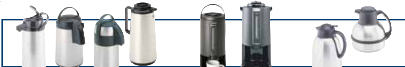
Complete line of Airpots for use with brewers with 13 3/8" clearance heights

ACCESSORIES: See the Bloomfield Brew Brew product catalog for a complete listing of brewers and accessories.