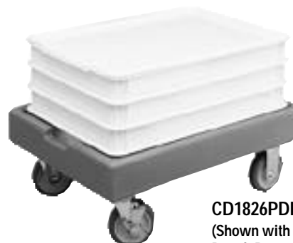
CD1826PDB (Shown with 3 each stacked Pizza Dough Boxes Product #DB18263CW)