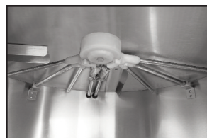
Independent spray arms blast water from the top and bottom for optimum cleaning, sanitizing and rinsing.