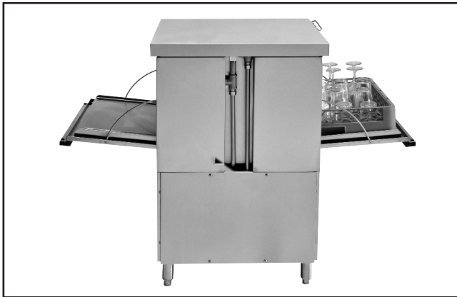
The GWX-200 can be loaded, unloaded or operated from either side of the bar.