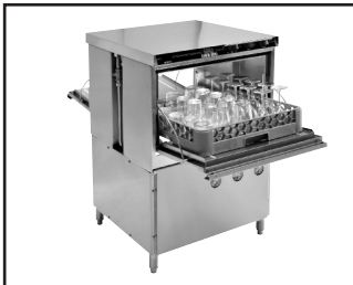
Front Door loading by server staff made easy and efficient.