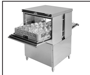
Back Door for bartender makes it easy to continue to serve customers while machine is producing clean sanitized glassware.