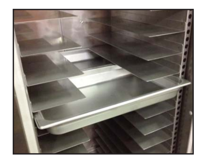
OPTIONAL PAN RACKS... Welded on extended angle slides at 3"spacing for 12"x20"x2.5" steam table pans and 18"x26" sheet pans (shown); pan racks for Design Specialties T-500 trays (not shown)