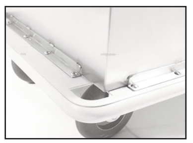
FULL PERIMETER BUMPER ... All aluminum with non-marking gray vinyl insert to protect cart and facility walls. Reinforced with angle brackets and bolted on to cabinet.

HEATER MODULE CONTROLS... Electronic controls with digital display. Programmable temperature settings.