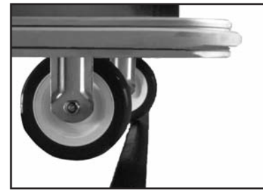
WHEEL-AHEAD CASTER CONFIGURATION... For easy moving over threshholds and uneven seurfaces. Six semipneumatic 8" large diameter casters for tight turning radius.