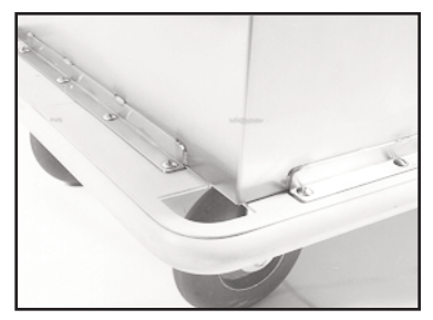
FULL PERIMETER BUMPER ... All aluminum with non-marking gray vinyl insert to protect cart and facility walls. Reinforced with angle brackets and bolted on to cabinet.

HEATER MODULE CONTROLS... Electronic controls with digital display. Programmable temperature settings.