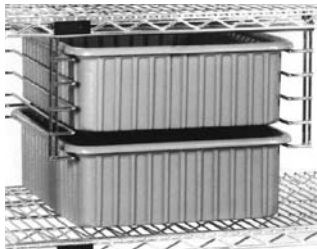
slide system with tote boxes