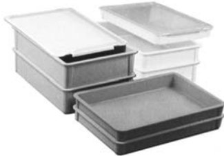
assorted molded fiberglass boxes and trays