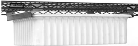
adjustable undershelf slides with tote box