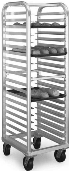
LIFETIME Series bun pan rack

Eagle LIFETIME Series Bun Pan Rack, model _____. Constructed of heavy duty 6063-T5 aluminum alloy. Fully welded frame. 1" square tubular crossbracing. Base consists of 1½" x 1½" square aluminum tubing with pretapped caster plates welded inside. 3¼" wide angle slides welded to uprights. Heavy duty 6" x 2" non-marking swivel plate casters.