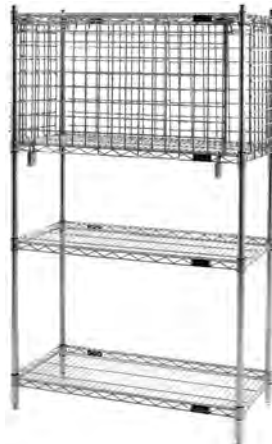
security module with flip-up door

(security modules shown assembled to wire shelf units)