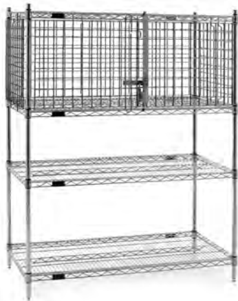
security module with hinged doors

Eagle Security Modules, model _____ (EAGLEbrite® zinc, Chrome, EAGLEgard® Epoxy, Stainless Steel) finish. Includes door(s), end panels, and rear panel. Available with hinged doors or single flip-up door. Fits in between two wire shelves that are spaced 20" apart.