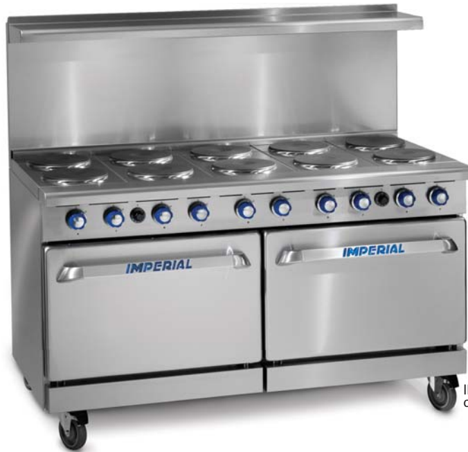
IR-10-E shown with optional casters