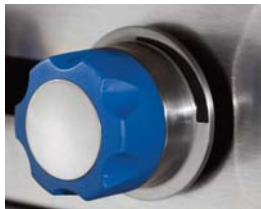
Durable cast aluminum with a vylox heat protection grip.