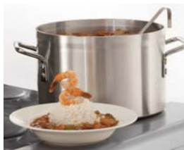
Large 5" (127 mm) stainless steel landing ledge for convenient plating.