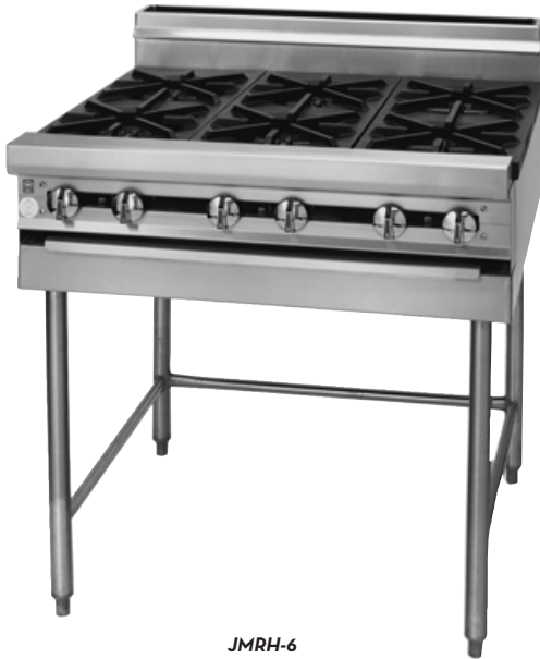
JMRH-6 Shown w/ legs

TITAN MODULAR OPEN BURNER RANGE (12" SECTIONS)