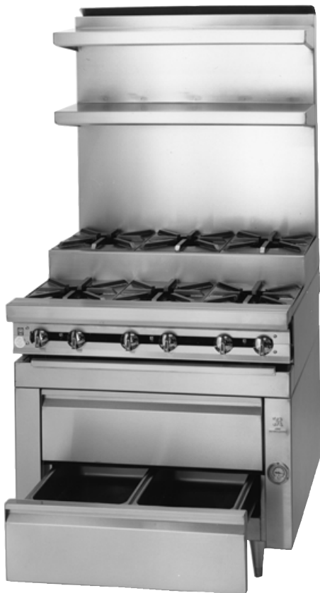
JMRHE-3-3 with double high shelf and mounted on JRLH-02R-T-36