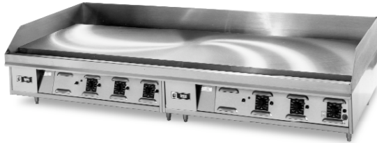
Model 172S shown