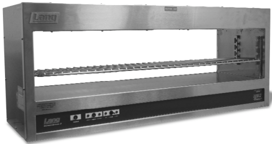
Model 148CMPT shown