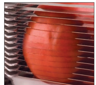
Blades are razor-sharp stainless steel for a smooth, precise cut.