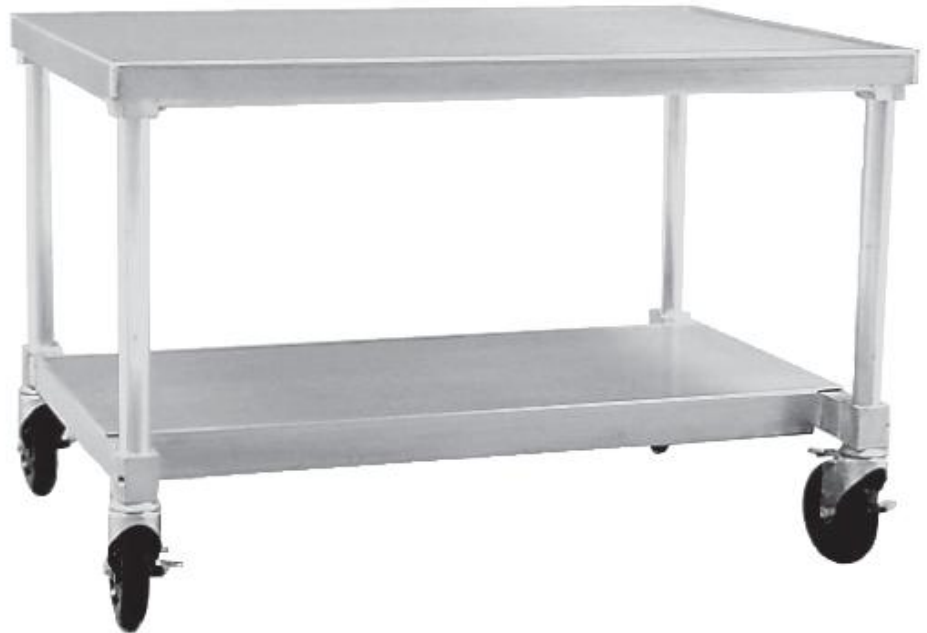
EQUIPMENT STAND SHOWN WITH OPTIONAL UNDERSHELF AND CASTERS

This all purpose stand is perfect for counter-top cooking as well as holding or serving equipment. Removable heavy-duty 12-gauge aluminum top and optional under shelf lift off for easy cleaning and are fully supported by the all welded, heavy-duty frame. Marine edge provides easy cleaning and equipment stability. Adjustable posts allow for quick stabilization and easy leveling on stationary units while 5" stem type casters provide smooth transportation for mobile units.