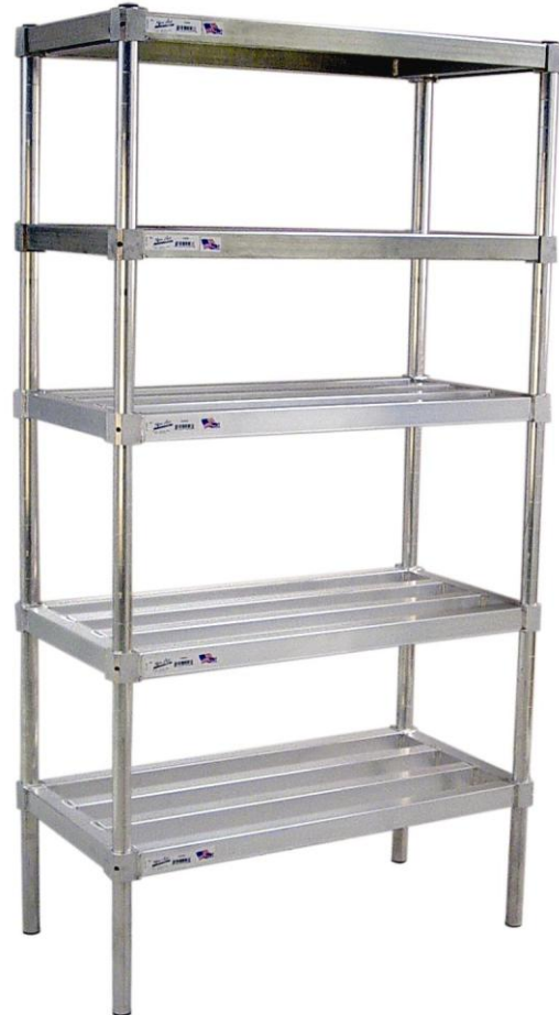
Adjust-A-Shelf – H.D. Series