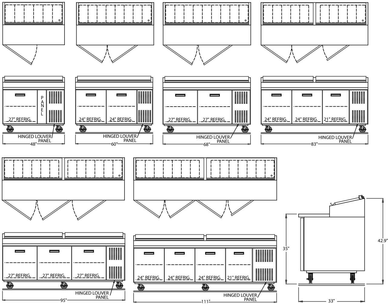
Drawings are to be viewed in the same order as the chart, one drawing to represent refrigerator and freezer units