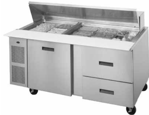
model 9045K-7 shown with optional refrigerated drawers

This equipment is intended for use in rooms having an ambient temperature of 86°F (30°C) or less.