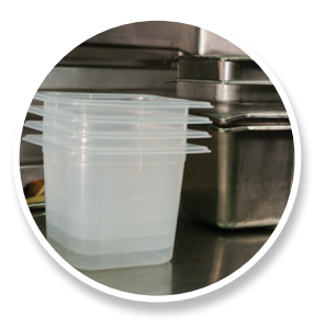
When not in use, nest together for compact storage