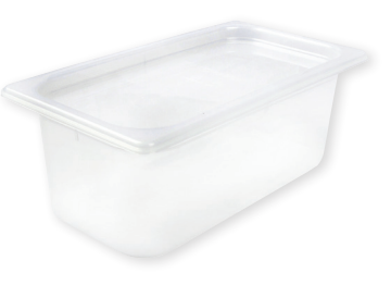
Quart 1/9 food pan