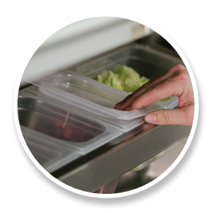
Patented design combines durability with a sealed lid to eliminate wrapping and preserve food longer

Because ModPans were invented by a working chef, you can benefit from a variety of features that work for your kitchen: