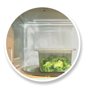
Stands up to wide temperature extremes, from freezing -10° F (-23° C) to heating 204° F (95.5° C)