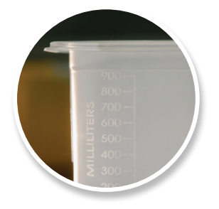
Graduated measurements are exact and etched on both sides of containers in standard and metric