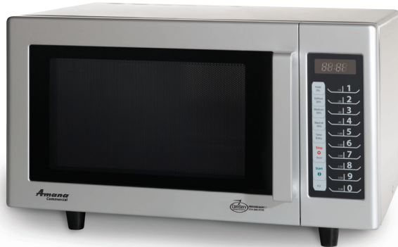
Model RMS10T and RMS10TS shown