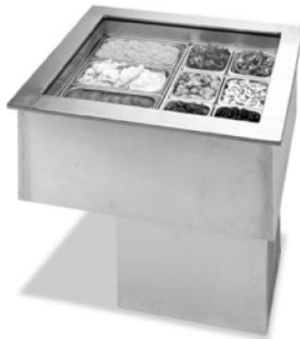
Model: Drop-In Cold Well