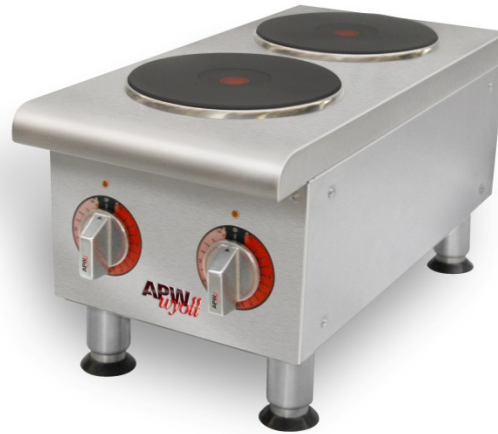
Model EHPi Electric Hot Plate