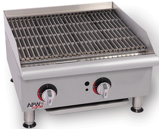
Model GCRB-24i Gas CharRock CharBroiler