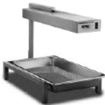
Model PD-1A Display Warmer