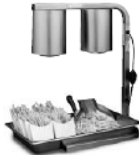
Model DW-1A Display Warmer