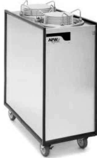
Model: Lowerator® Enclosed Mobile Adjustube® Dispensers

Mobile enclosed cabinet-style Dish Dispenser utilizes Adjustube® self-leveling tubes that are field adjustable for weight and diameter. Holds and dispenses plates, saucers, or bowls. Hole cutouts in base align lower end of tubes in position to prevent movement during transit. Field adjustable for varying weight loads up to 100 lbs. per tube. Available in two and three-stack units, heated and unheated models.