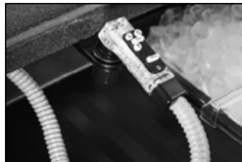
Premium quality 5-button, post-mix soda gun by Wunder-Bar® with fast, low foaming delivery. (shown on Cambar650DS model)