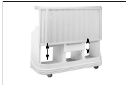
Detachable front for easy access to inventory and routing lines, tubes and hoses.