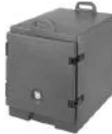
For Camcarrier (300MPC)