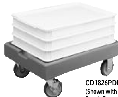
CD1826PDB (Shown with 3 each stacked Pizza Dough Boxes Product #DB18263CW)