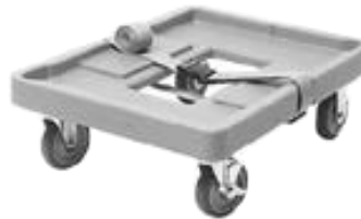
CD400 (Shown with Optional Strap)