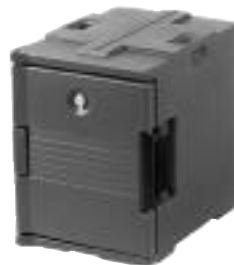
For Camcarrier (UPC400)