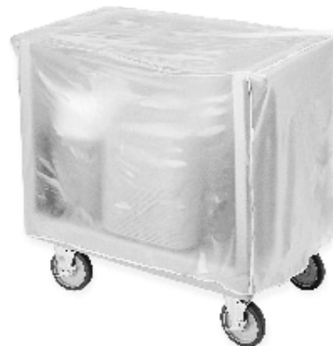
Adjustable Tray and Dish Cart with Vinyl Cover