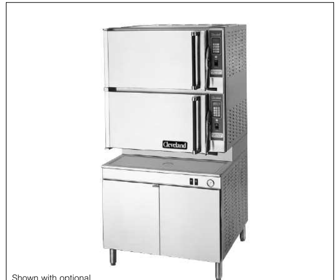
Shown with optional Electronic Timer