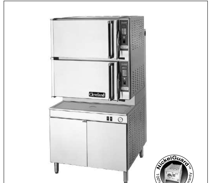
Shown with optional Electronic Timer