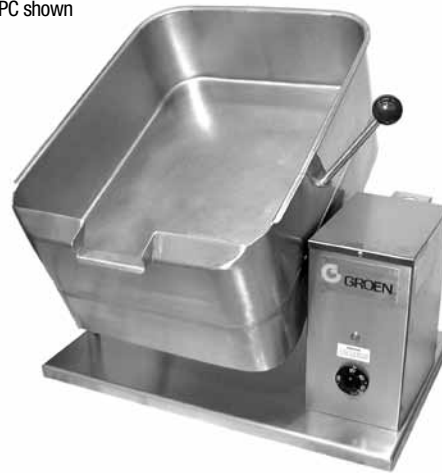
Model TD/FPC shown

Unit to be thermostatically controlled to automatically shut off when desired temperature is reached and to turn on when product temperature falls below desired setting. Unit to have Hi Limit thermostat as safety feature.