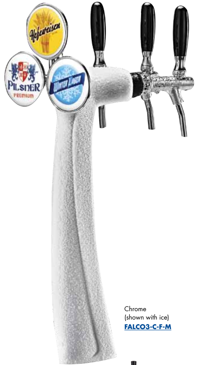
Chrome (shown with ice) FALCO3-C-F-M