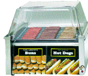
Model 30SCBD with Sneeze Guard