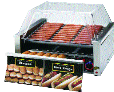
Model 50CBD with Sneeze Guard