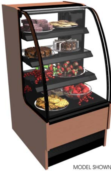
MODEL SHOWN: HMG2653R