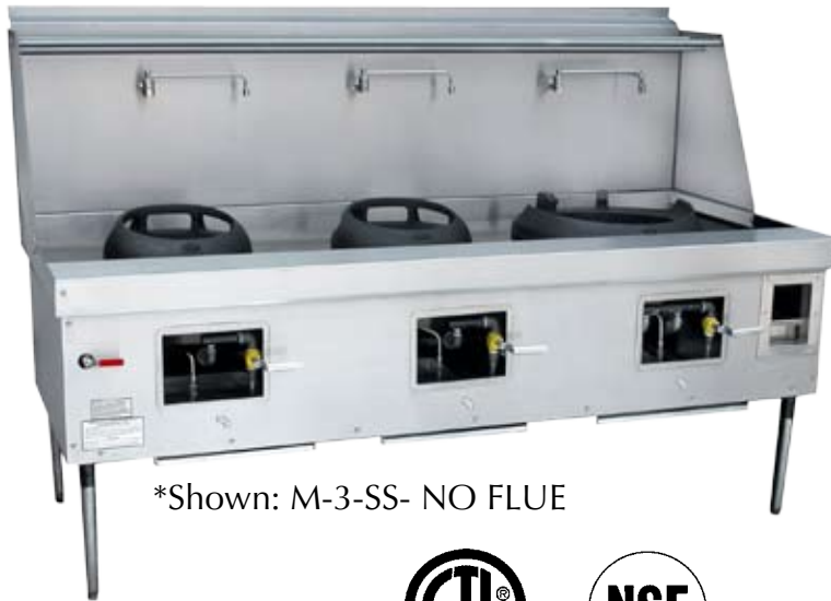
*Shown: M-3-SS- NO FLUE