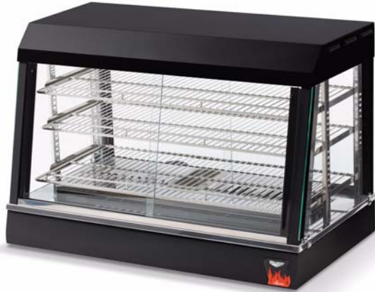
Cayenne® Hot Food Merchandiser