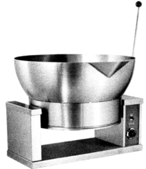
ACECTRS-16 Model Shown