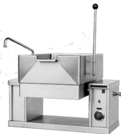
ACECTS-12 Model Shown