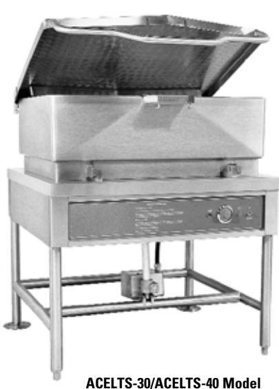
with Standard Features of Adjustable Bullet Front Feet and Rear Flange Feet