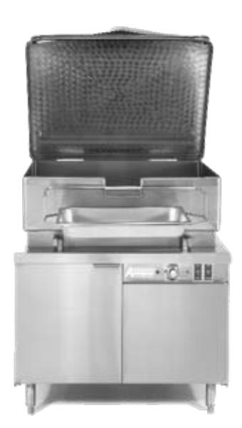
ACEMTS-30/40 Model Shown