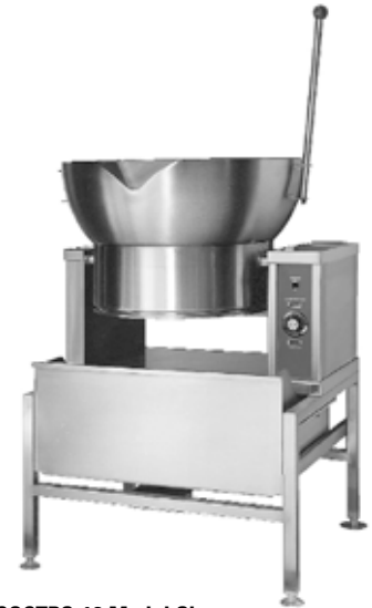
ACGTRS-16 Model Shown with Optional Stand