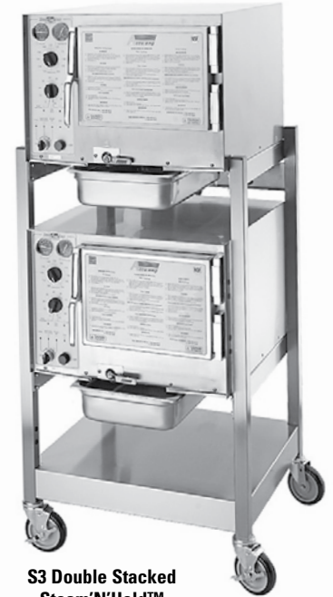
S3 Double Stacked Steam'N'Hold™ Steam Cookers shown with double stack stand (with casters) and 4" drain pans